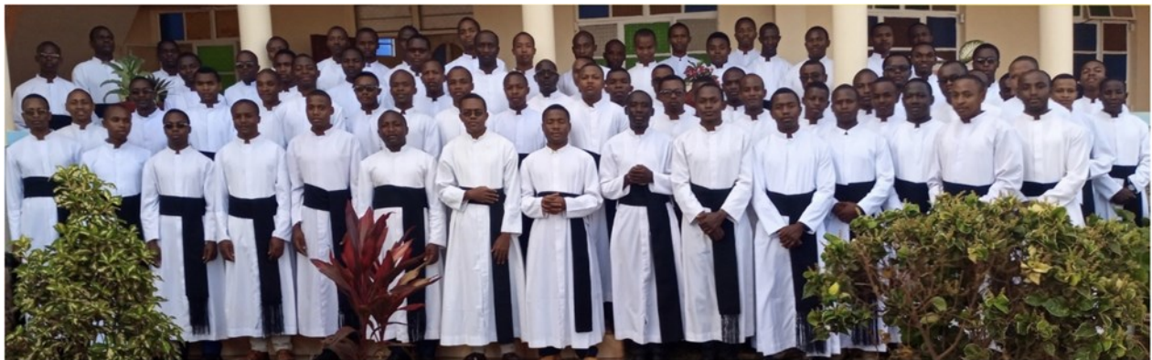
All of the seminarians of the Apostolic Life Community of Priests in Tanzania

Mission Appeal: As a young Missionary Community, they have many needs. At present, they are facing the challenge of meeting the tuition fees for 77 major seminarians who are studying both Philosophical and Theological Studies at Jordan University in Morogoro, Tanzania. Any assistance they can get from this Mission Appeal will help support the formation of these young men who will soon move into the priesthood. Those who will directly benefit can't thank you enough for your consideration in this. Your generous financial and spiritual help will make the difference. Please be generous in your response to Father's appeal.