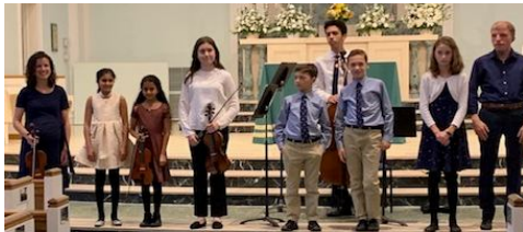
Members of the Metropolitan Symphony Orchestra St. Catherine of Siena Concert October 27