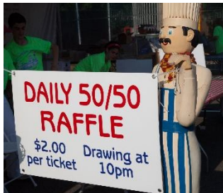
50/50 Cash Prizes