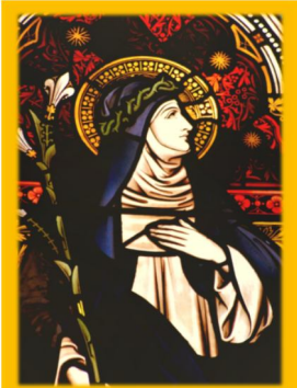
Saint Catherine of Siena

There are no language Masses during July and August.