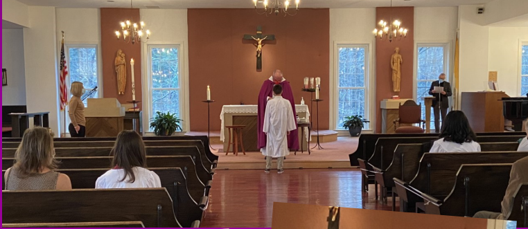
Confirmation at St. Agnes