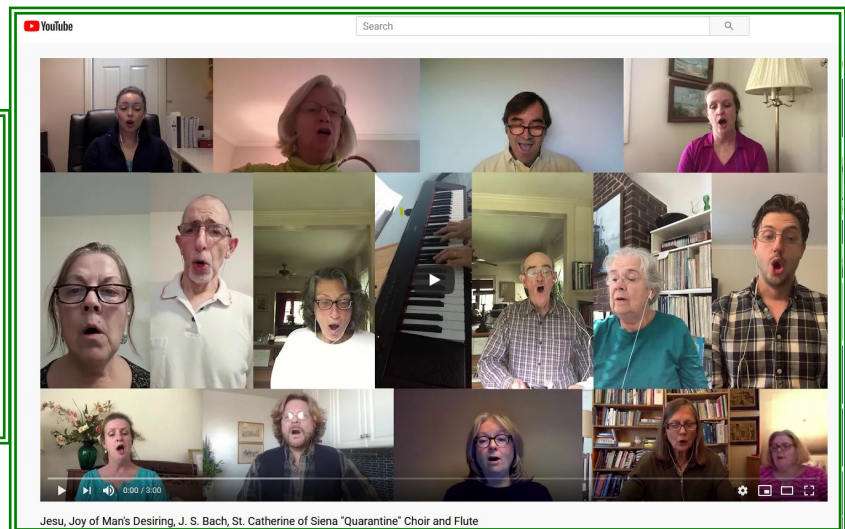
Jesu, Joy of Man's Desiring, J. S. Bach, St. Catherine of Siena "Quarantine" Choir and Flute

Click Here to enjoy our Traditional "Quarantine" Choir & Flute Virtual Recording: Jesu, Joy of Man's Desiring, J. S. Bach