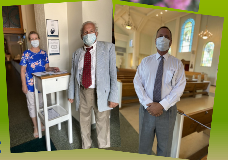
Sunday Mass Volunteers at St. Catherine's