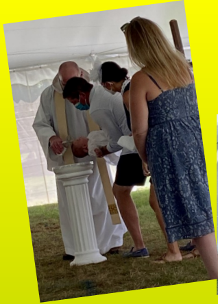
Sacraments of Baptism and First Holy Communion under the tent at St. Agnes