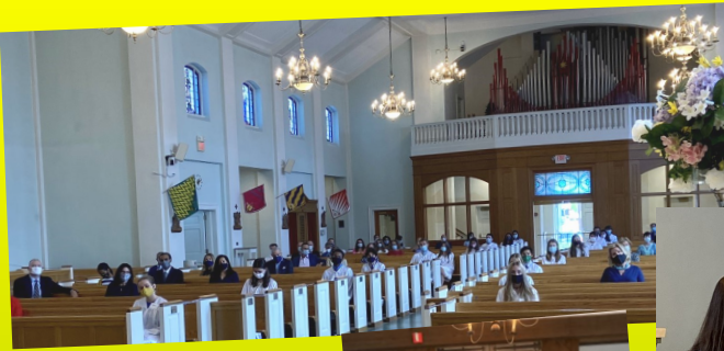
Celebrating the Sacraments on both church campuses