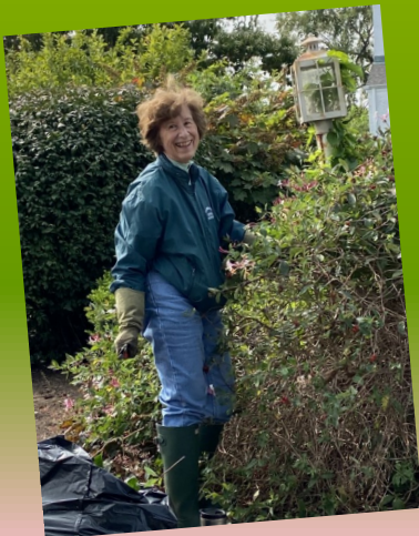
Dedicated volunteers on our campus grounds and for the community