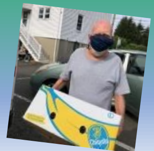
We love ALL of our Neighbor to Neighbor donors!