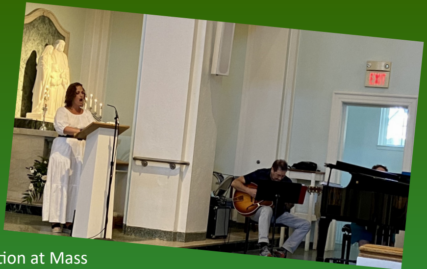
Our Team in action at Mass